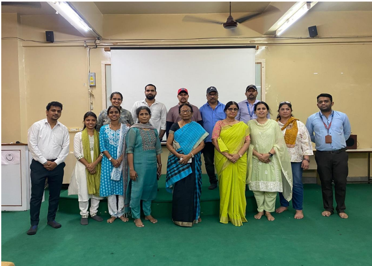
MUQABALA 2025 – 2026 ORGANIZING TEAM